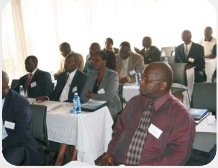
Lecturers listen keenly at a preparatory meeting on the CMA University Challenge shortly before it was launched on 13th October, 2008.